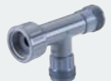
5. Pure water T-connector