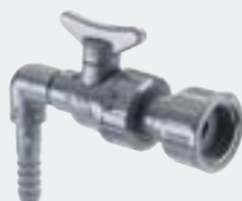
2. Pure water outlet valve