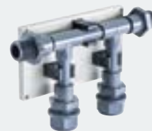
4. Pure water distributor block