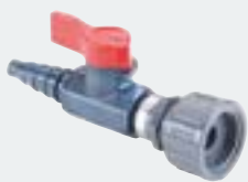
1. Pure water outlet valve